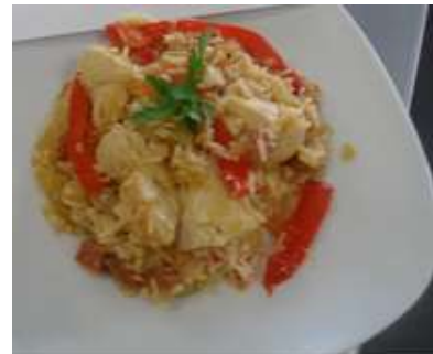
Year 10 cinnamon Buns