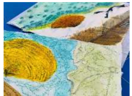
Year 10 exploration of "Fossil Coast"