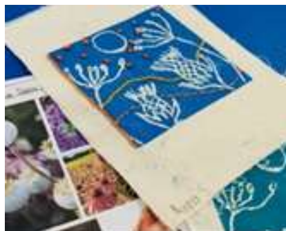
Year 9 poly-printing