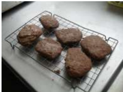
Year 7 cookies

Food technology has seen students in year 7 learning safety in the kitchen while making pizza toast, scones and cookies. Year 8 have been looking at raising agents to make pizza dough and American muffins. In year 9, it's been all about creativity in their cooking to make Jambalaya, and putting their own spin on Victoria Sandwich cakes. Year 10 have been developing their practical skills in a range of starters, mains and desserts.