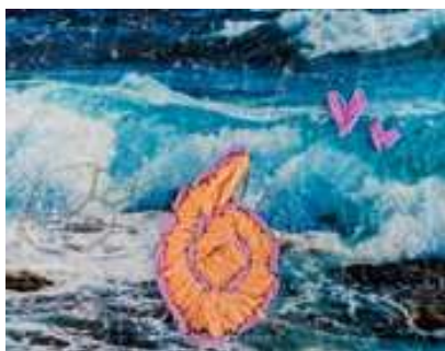
Year 7 embellished seascape